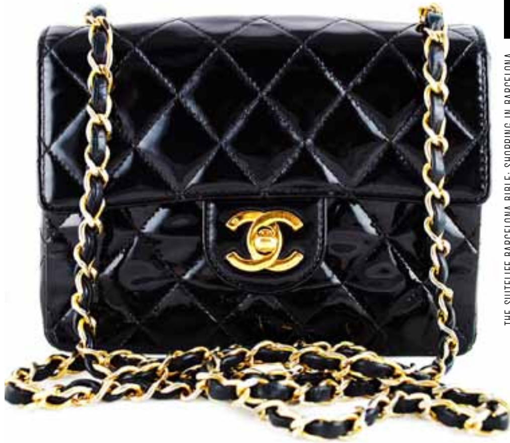
THE SUITELIFE BARCELONA BIBLE: SHOPPING IN BARCELONA

Ordning & Reda: Established in Scandinavia, Ordning & Reda is a unique concept. With a pure and simple design, one will find everything from notebooks, pen cases and diaries to beautiful